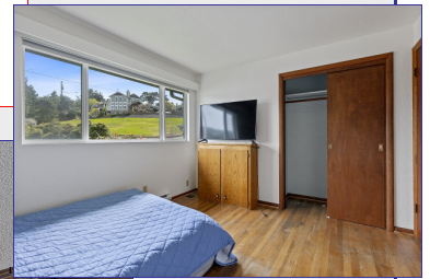
Nice Oak Floors