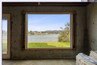
Basement Lake View