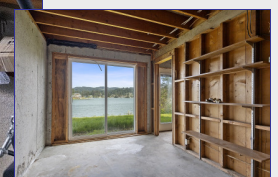
Basement Lake View