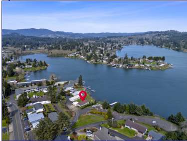
Aerial Home View