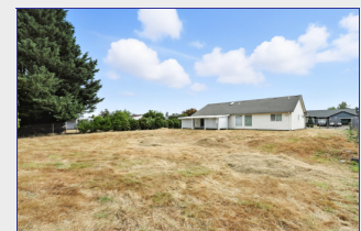
Extra Roomy Backyard

Above information is not guaranteed, but is believed to be accurate.