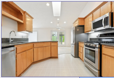
Kitchen & Skylight