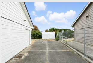
Fenced RV Parking