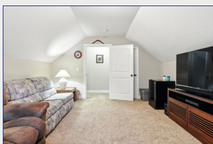
Private Office/Den/5th Bed