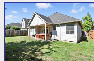
Fully Fenced Backyard

Above information is not guaranteed, but is believed to be accurate.