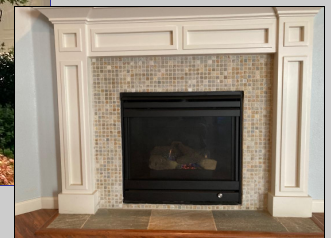
Gas Fireplace & Heatilator