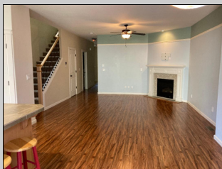
Roomy Living Room