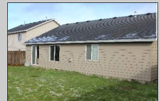
Roomy Fenced Backyard

Above information is not guaranteed, but is believed to be accurate.