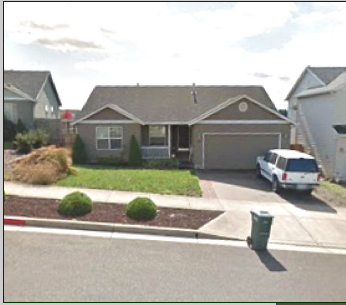
Great Curb Appeal!