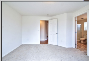
Master Bedroom View