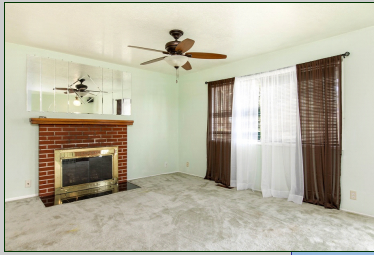
Living Room View