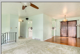
Living & Dining Areas