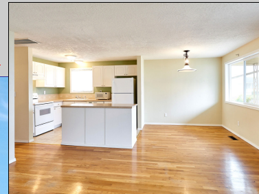
Kitchen & Dining Area