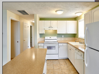
Light & Bright Kitchen