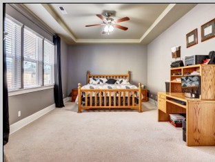
Big Master Bedroom