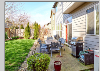
Patio & Fenced Backyard

Above information is not guaranteed, but is believed to be accurate.