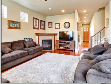
Spacious Family Room