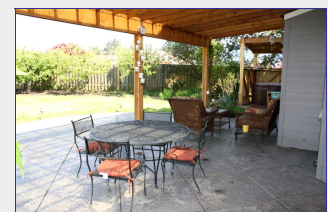
Large Backyard with Covered Patio

Above information is not guaranteed, but based on sources deemed reliable.