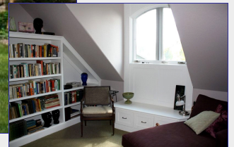
Light & Cheery Bedroom w/ Library