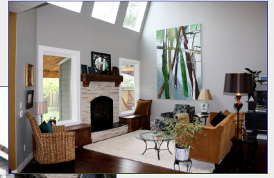
Comfortable Living Room