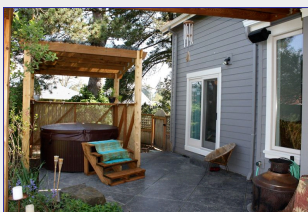
Patio & Hot Tub off Master Bedroom

Contact Roy Widing, Principal Broker: (503) 470-0201 or Roy@CertifiedRealty.com