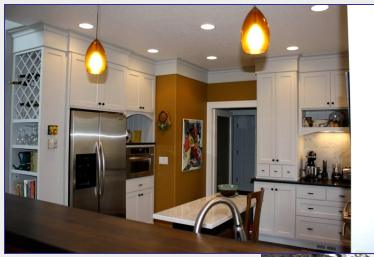
Kitchen: Granite & Marble